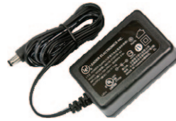
AC Power Supply