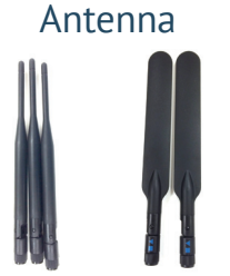
Antenna WiFi 3G/4G