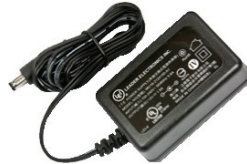
AC Power Supply