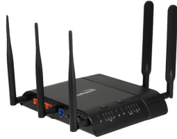
Cradlepoint ARC MBR1400