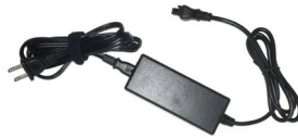
AC Power Supply